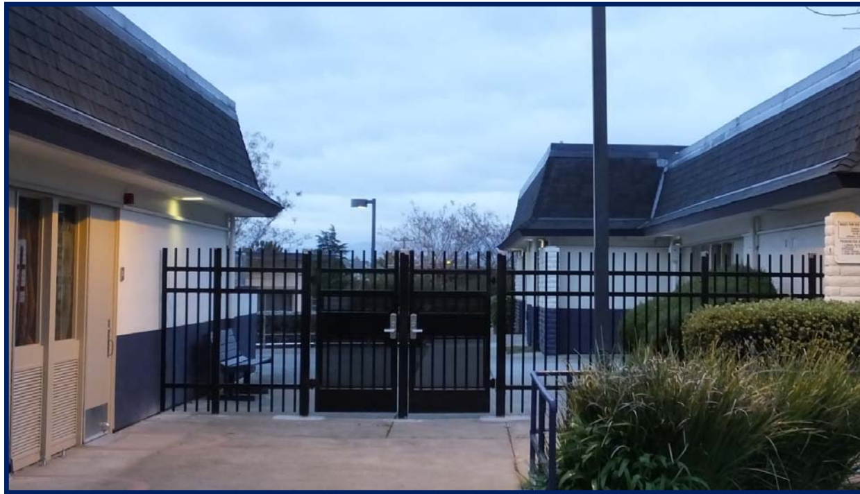
Fencing between and Main building and Kindergarten