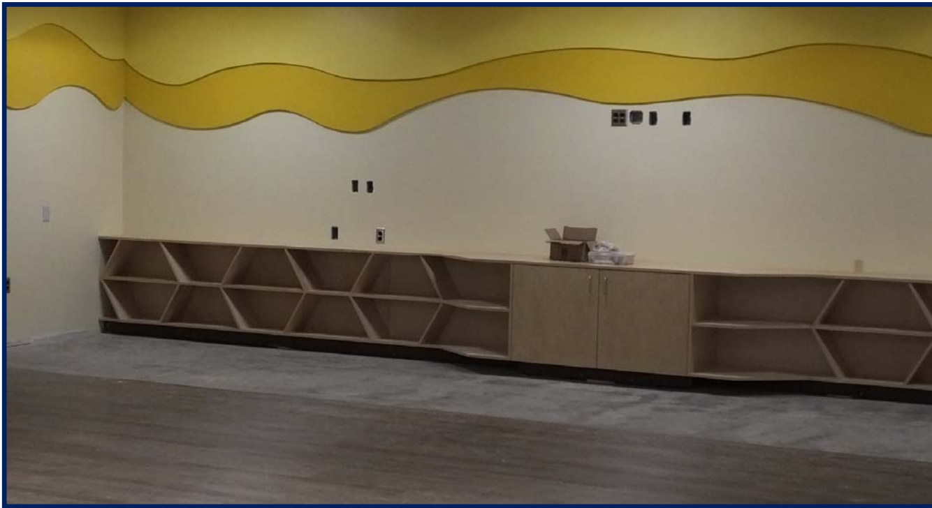
Small group space