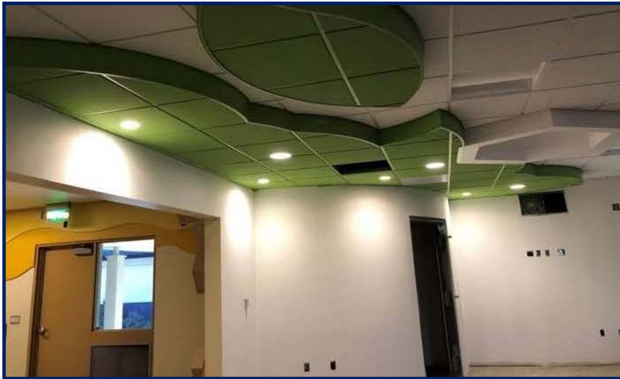
Main FIS space

Laneview FIS Project – Project to be completed by March 5, 2018