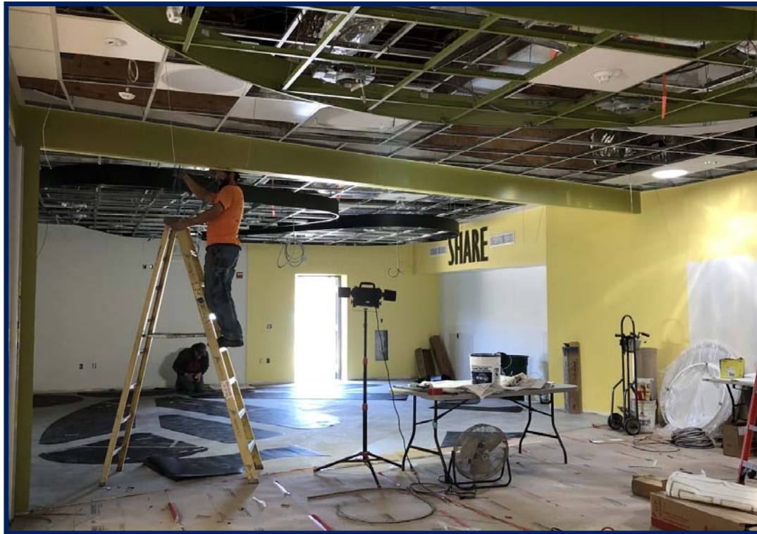
Main FIS space

Majestic Way FIS Project – Project to be completed on March 12, 2018