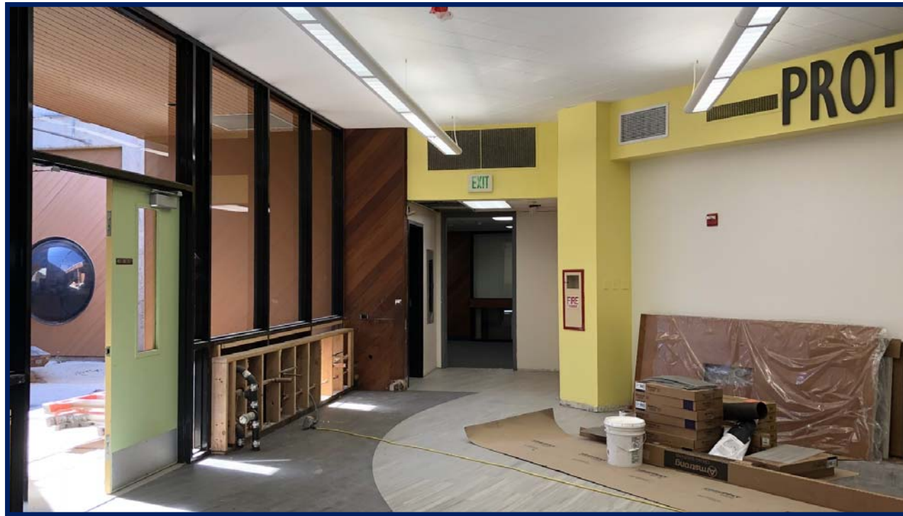
FIS sink area