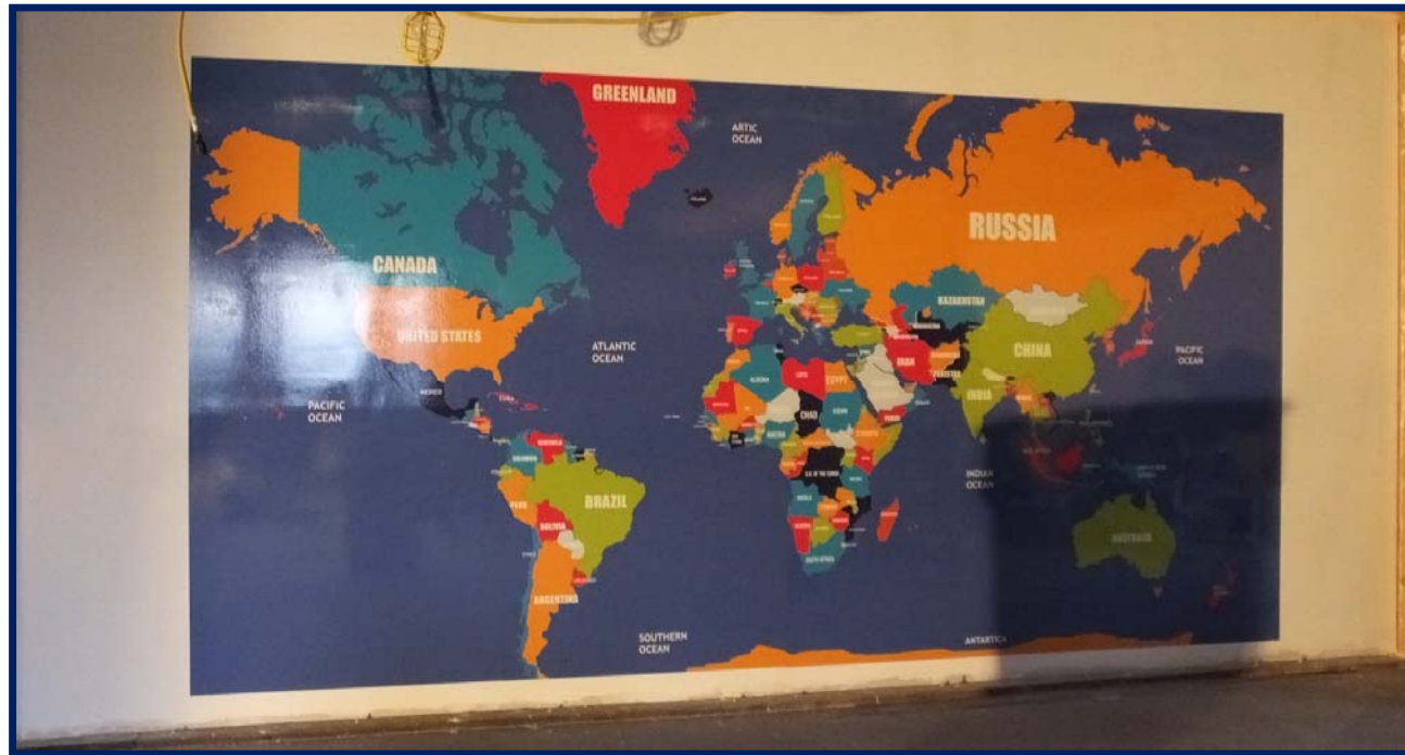
Main FIS space